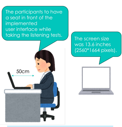
Figure 2. Experimental settings